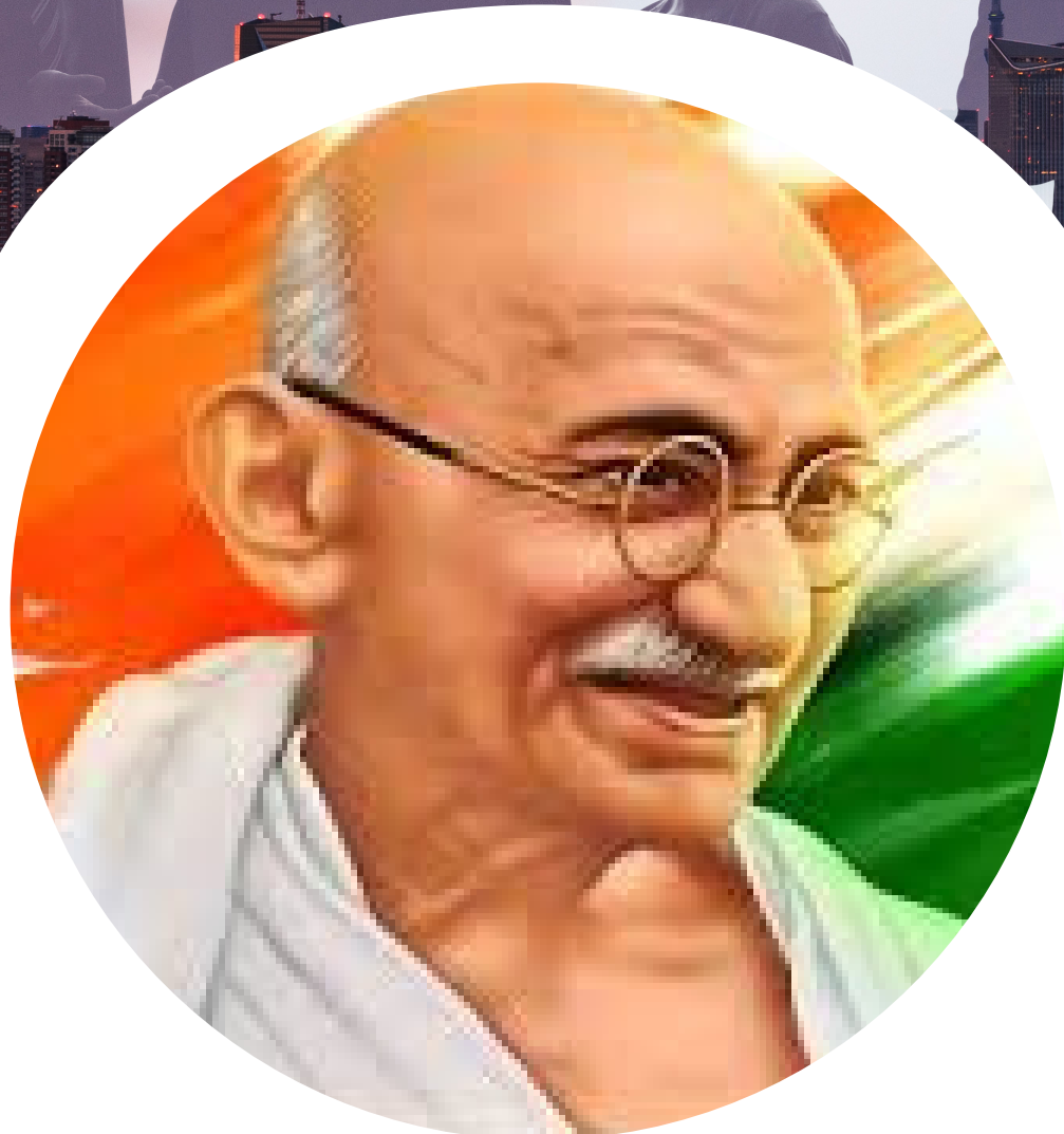
GANDHI JAYANTI (FATHER OF OUR NATION)